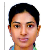
CHINJU BABY KOODERANJI L-B, R-C+, W-B, S-B