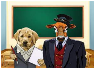
Revealing the characters Backu & Yomol

D ear language lover, as we know, our language ambassadors Yomol and Backu are engaging in a conversation. The following extract is a piece of communication between them. What you are supposed to do is to replace them with your family members/ beloved people and speak aloud the respective roles.