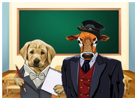
Revealing the characters Backu & Yomol

improved by constantly indulging in listening activities. 'Listen and speak' is the axiom followed in communication. Read aloud is another brilliant technique to improve our speaking skills. Let our faculties get printed with the English sounds. Let us add emotions and blood supply to English words so that the power hidden in each word can be brought out. Let us be genuine in our purpose, be a language enthusiast and a learner, all the best!